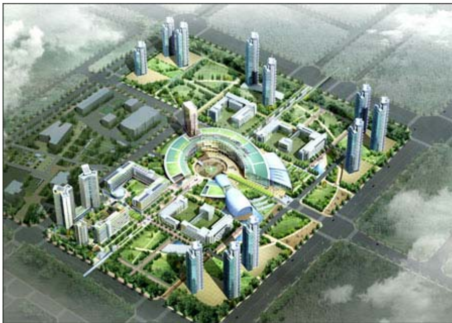
Figure 3: Sketch of Songdo Global University Campus

academic administration. A special independent administration (i.e., Songdo Global University Campus Foundation or SGUF) will manage campus facilities. SUNY Korea (State University of New York) is opening in February 2012 and will offer graduate program in two areas of study: computer science and technology and society ( www.sunykorea.ar.ku ). In 2013, Belgium's Ghent University will begin offering undergraduate courses in biotechnology, environmental technology and food technology. University of Utah has signed an MOU and is planning to offer degrees in education. Alfred University and the University of Illinois at Urbana Champaign also signed MOUs with IFEZ. Korean universities, too, have been successfully recruited. These include Yonsei University, Incheon University, and Gacheon University. The Seoul National University and Johns Hopkins University have also shown interest in building campuses at Songdo.